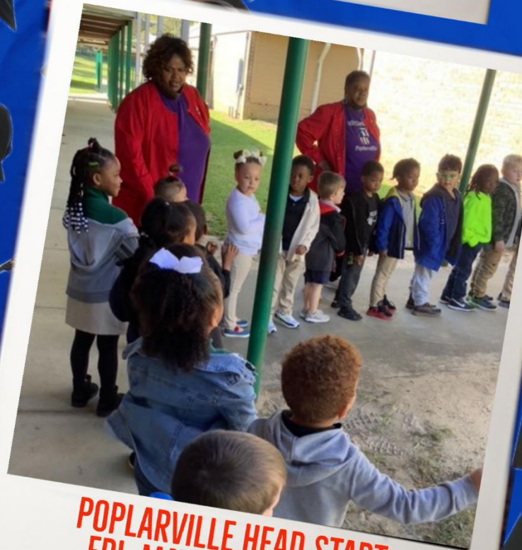
POPLARVILLE HEAD START FRI, MAY 19 @ 9:30AM POPLARVILLE HEAD START