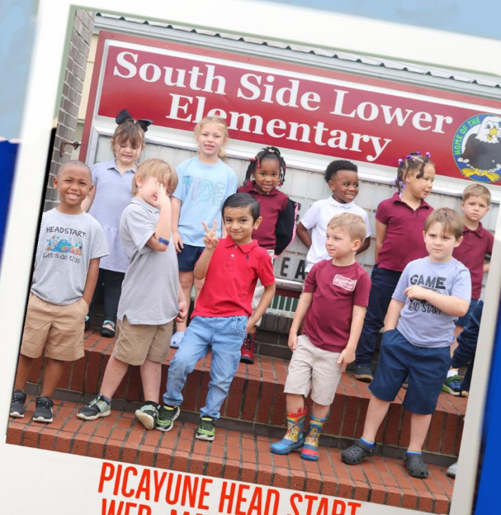
PICAYUNE HEAD START WED, MAY 17 @ 6PM PICAYUNE AUDITORIUM