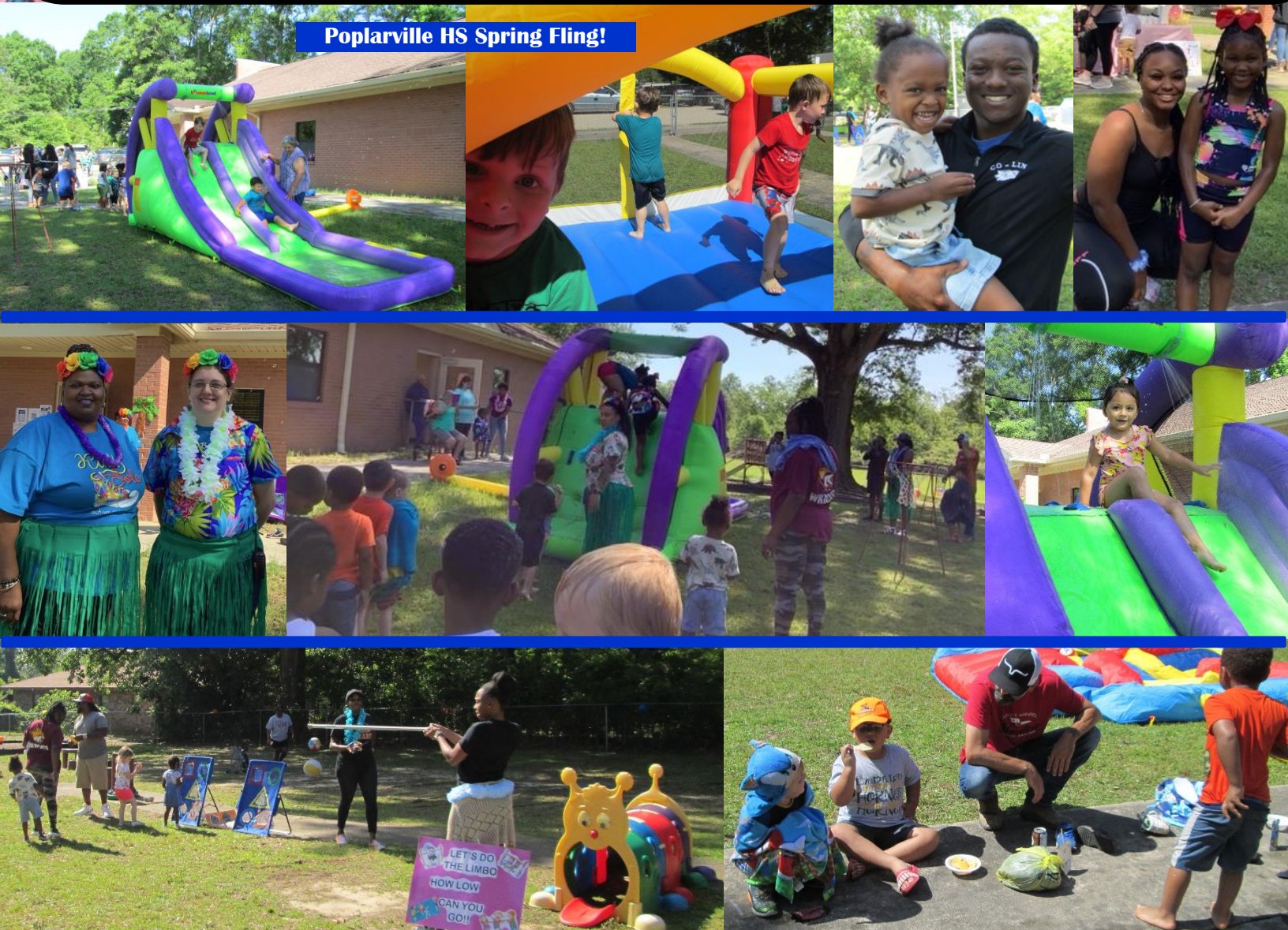
Poplarville HS Spring Fling!

Picayune School District Early Childhood Programs